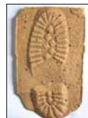
Footprint casting using Hard Core Dental Stone