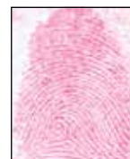
Processed with Ninhydrin