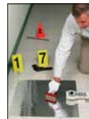
Lifting dust print from a tile floor using an Electrostatic Dust Print Lifter.

Students are encouraged to bring a camera to class, DSLR preferred, but not required.