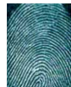
Processed with Cyanoacrylate