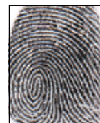
Processed with Black Powder

Students can register for the class by logging onto Sirchie's website at http://www.sirchie.com/training.html . Off-site classes must be paid by credit card or the issuance of your departments purchase order. If you have any questions, please call Sirchie Education and Training at (800) 356-7311 or (919) 554-2244.