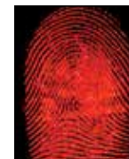
Processed with DFO